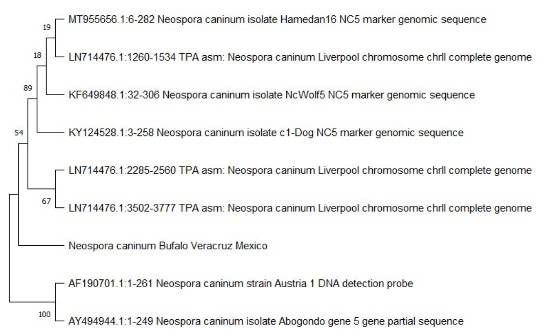
Figure 2. Phylogenetic tree of N. caninum based on repetitive the Nc5 gene. Values on the tree nodes correspond to bootstrap proportions (%). Identified isolates characterized by geometric shapes. The different isolates are shown with their accession number in the GenBank.

The Blast tool returned a similarity ranging from 90 to 93% (accession numbers: MG973172.1; MT709296.1; KX683873.1; KF649847.1; KU253799.1; MT709298.1; KF649848.1; MT955656.1), with the highest value for the sequence described in a work from Iran (Figure 2).